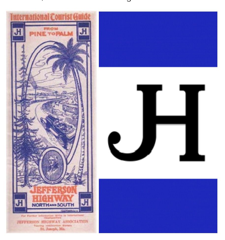
Jefferson Highway brochure (left) and colored marking band (right)

Also that year, another great auto trail (almost 2,500 miles long) was begun, and it linked New Orleans with other towns and cities across the United States. But this time, the Crescent City was the southern terminus, or lower end of this great north-south trail.