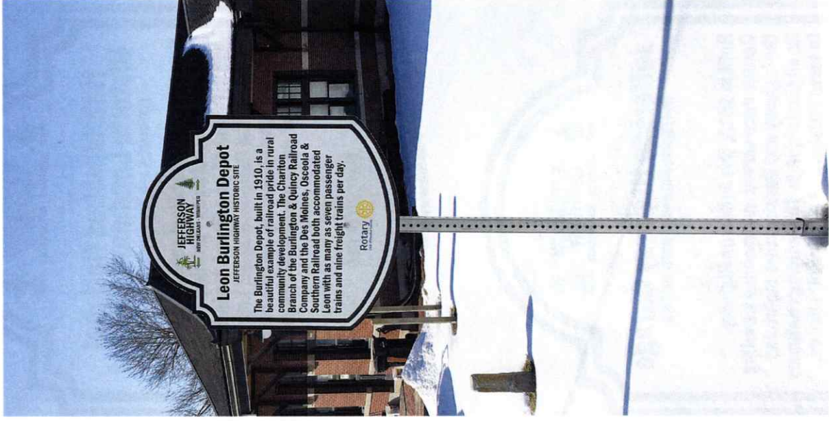
JEFFERSON HIGHWAY HISTORIC SITE